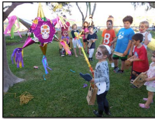
A fun time was had by all who tried to break open the candy-filled piñata.