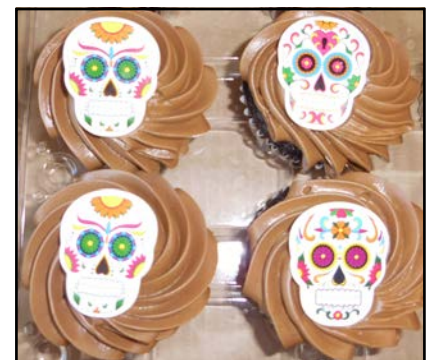
Even the adults at the event got into the coloring activities. The colorful Sugar Skull masks were created and worn by those who did not get their faces painted. Plastic Sugar Skull rings were used to decorate the cupcakes.